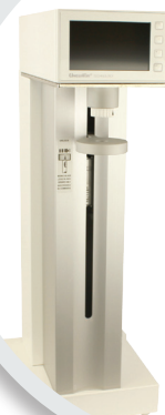
THE NEW UNGUATOR Q

HES actively and consistently attends national, local, and state shows and conferences. Look for our booth this year at NCPA, IACP Compounders on Capitol Hill, APHA, ACA Mid-Year Meeting, and many more!